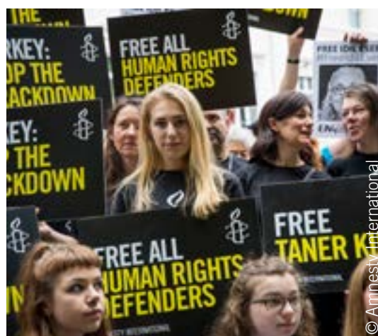
Demonstration outside the Turkish Embassy in London, UK. 12 July 2017.

Our work protects and empowers people – from abolishing the death penalty to advancing sexual and reproductive rights , and from combating discrimination to defending refugees' and migrants' rights . We help to bring torturers to justice. Change oppressive laws... And free people who have been jailed just for voicing their opinion. We speak out for anyone and everyone whose freedom or dignity are under threat.